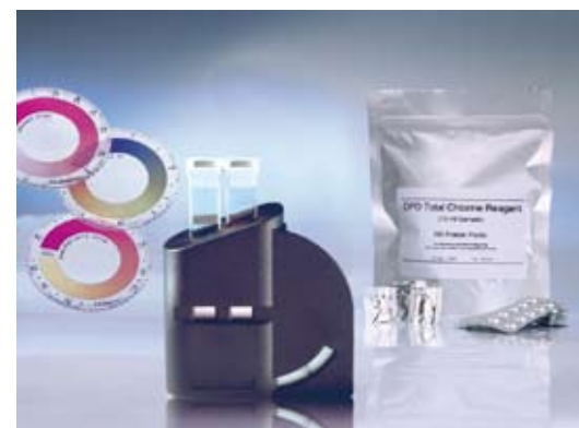
CHECKIT®Comparator with Powder Reagent