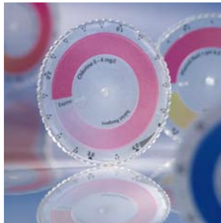
CHECKIT® Discs with continuous colour scales