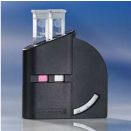
Front view of the CHECKIT® Comparator with cells