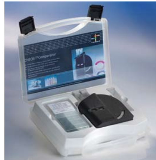
Test Kit complete in case