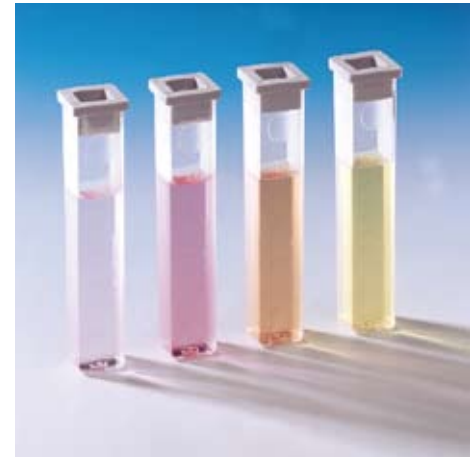
Plastic cells, frosted on two sides, volume 10 ml, path length 13.5 mm, with lid