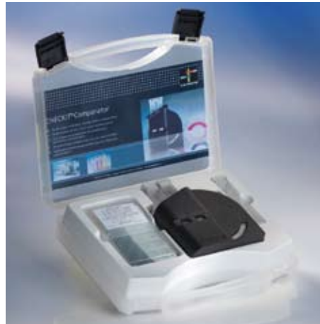
Test Kit complete in case