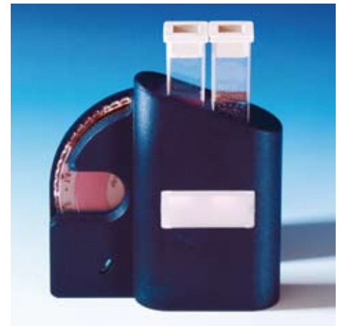
Rear view of the CHECKIT® Comparator with disc, diffuser and cells