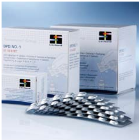
Tablet reagents in foil blister strip