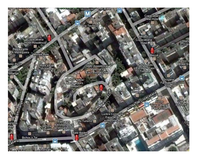
Figure 4. Hydrant Map visualization