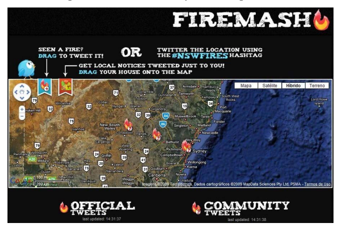
Figure 3. FireMash, an application that allows the population to report wildfires in Australia via Twitter.

Earlier this year, Google, Microsoft, Yahoo!, NASA and the WorldBank sponsored an event where hackers gathered to generate systems that could be useful for people facing emergency situations [8]. During this event, many ideas for citizen empowerment in crisis situations were generated, and a few were implemented in a two day workshop.