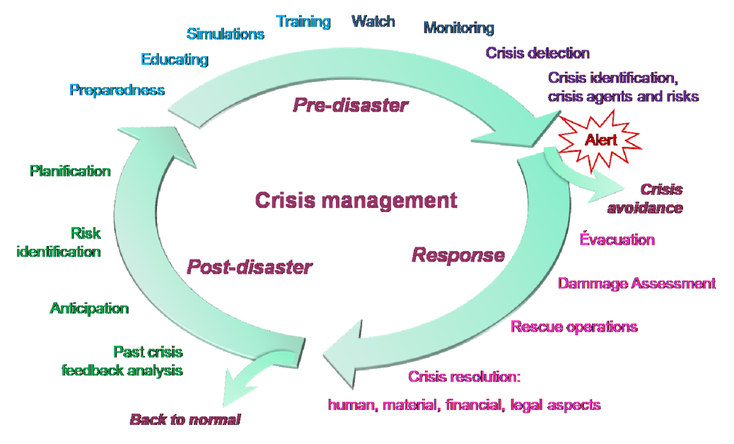
Figure 1. Cristis Management Activities (from [1])

Aligne [1] defines a crisis as a situation in which there is a break from previous events. A crisis threatens the functioning and values of an individual or community, and there is an urgent need for action despite difficulties. One of the most important characteristics of a crisis is that it is unpredictable and cannot be totally anticipated by scenarios. To resolve a crisis, it is important to reflect and gather information with which to mobilize resources. Crisis management is modeled as a cycle in which several activities take place. These activities happen in three moments: pre-disaster, response (during the disaster) and post-disaster [1]. The cycle and activities are shown in Figure 1.