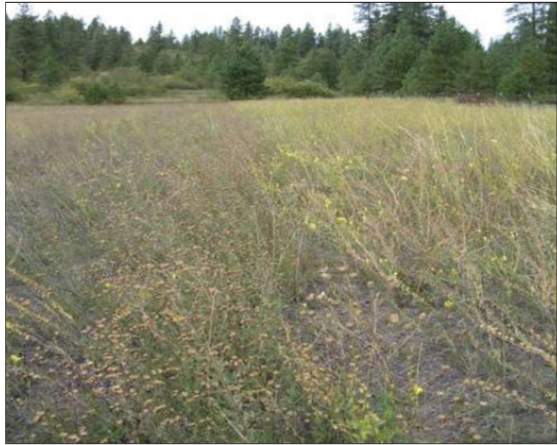
Figure 4. Effects of invasive plant removal without re-seeding. Spotted knapweed, the purple flowered plant on the left, has been replaced by Dalmatian toadflax, the yellow flowered plant on the right. The right side of the field had been treated with herbicides.

Only native grasses were seeded onto this site in 1998. Following the seeding, the area experienced a relatively wet year (128% of the 30-year average), while the next 3 years brought 79%, 90%, and 69% of average precipitation, respectively. Foliage production in this area was severely limited during this 3-year drought. Low organic matter soils and low precipitation during the early stages of grass recovery would have doomed a restoration effort focused at rebuilding a tallgrass prairie. However, the seed mixture used nine grass species whose moisture demands spanned a 500-mm rainfall gradient. The plant community that emerged (Figure 5) was dominated by a warm-season plant, salt sacaton ( Sporobolus airoides ), a species usually abundant only in alkaline or dry saline soils. To our knowledge, no such soils occur naturally in this area. Salt sacaton was solely responsible for about half of the vegetation cover. Other warm-season grasses common in mixed-grass and shortgrass steppe provided another 25%