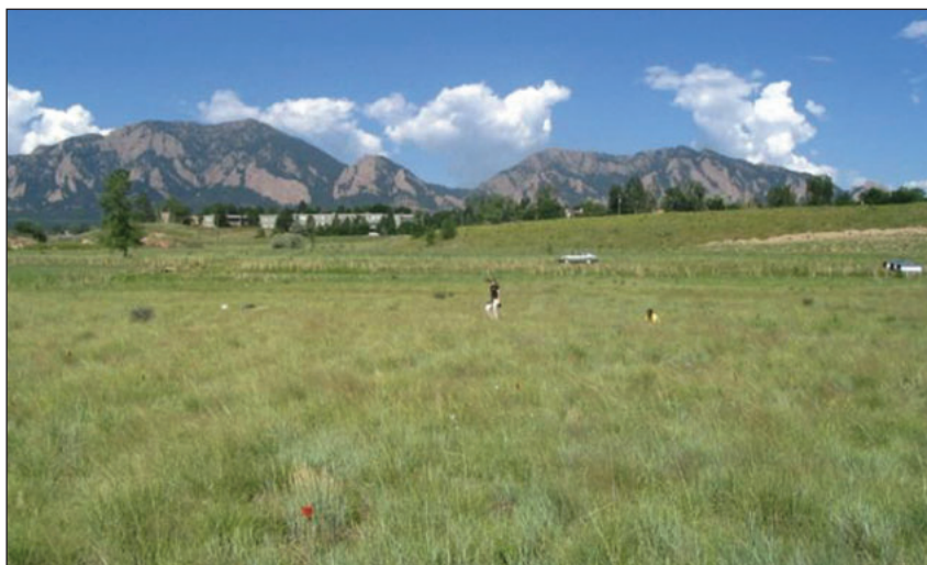
Figure 5. Revegetation site (foreground). What was a tallgrass prairie until the 1950s and then a gravel pit until the mid 1990s is now a mixed-grass prairie.

fact that traditional management approaches could not be used and/or were not likely to achieve management goals. In the first example, we have a novel management approach maintaining a highly desirable relict system which appears capable of persisting outside its HRV, and in the second example, the managers used an “uncertain climate seed mix” to generate a novel ecosystem that appears to be both drought and weed resistant.