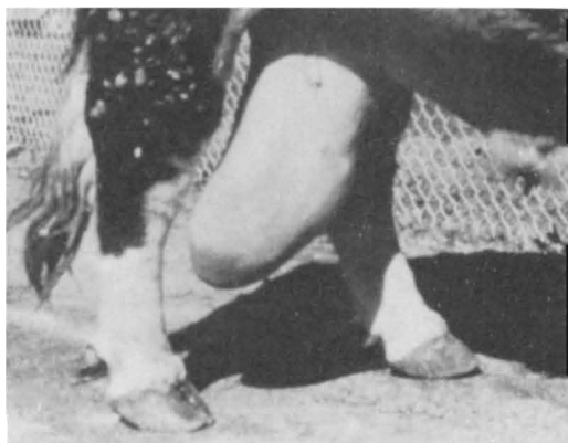
Fig. 2—Inguinal hernia in a mature Hereford bull.