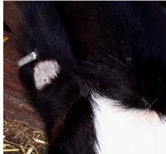
Fig 3: Ringworm lesions are greyish, well-circumscribed, and are more common on the head and neck (ear in this image).

Ringworm is common in young stock and is readily transmitted to humans (zoonosis). The greyish lesions are slightly raised, well-circumscribed, and are more common on the head and neck but may extend over much of the body.