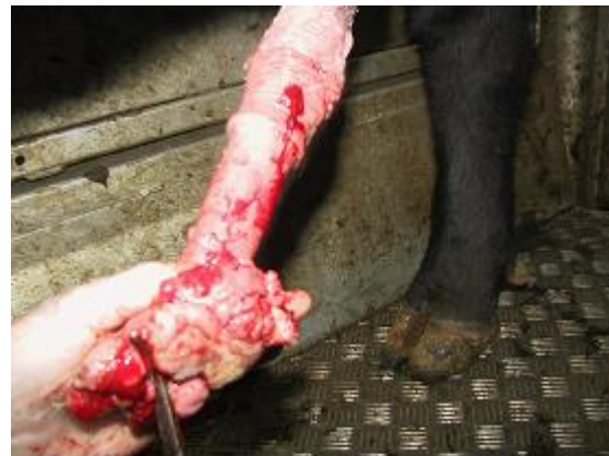
Fig 7: Attempted surgical removal of papillomas on the glans of a bull's penis under regional anaesthesia.