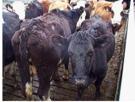
Fig 9: Dermatophilosis affecting out-wintered cattle.

Dermatophilosis rarely causes significant disease in cattle. Transmission of infection requires wet conditions and close contact. Exceptionally prolonged wet weather during the summer months and those cattle outwintered, produce moist skin that allows penetration of the bacterium and establishment of infection. In the UK, dermatophilosis is encountered along the dorsum where it causes serum exudation and scab formation at the base of the hairs. The lesions rarely develop clinical significance.