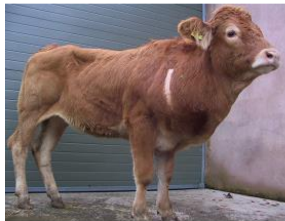
Fig 10: Large superficial swellings can be investigated ultrasonographically by your veterinary surgeon. This swelling was a haematoma.

Cellulitis lesions can result in severe lameness with painful swelling over the affected area. Cattle are pyrexia and anorexia, with a much reduced milk yield. Large swellings adjacent/involving the legs cause mechanical lameness. In many cases an abscess may not result in illness.