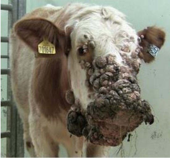
Fig 8: Extensive growths that fail to resolve, may be seen in immune suppressed animals (e.g. persistent BVDV infection).

Papillomatosis is self limiting and most cases will resolve without treatment in 1-12 months. Owners often request treatment in cases where affected breeding cattle are being prepared for sale, mainly because such animals are unsightly. Autogenous vaccines can be prepared for individual cattle but there are no controlled studies to prove their efficacy.