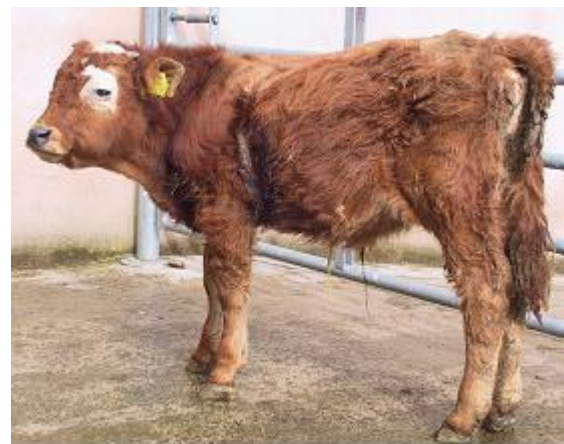
Fig 4: Ringworm is often worse in poorly growing animals.