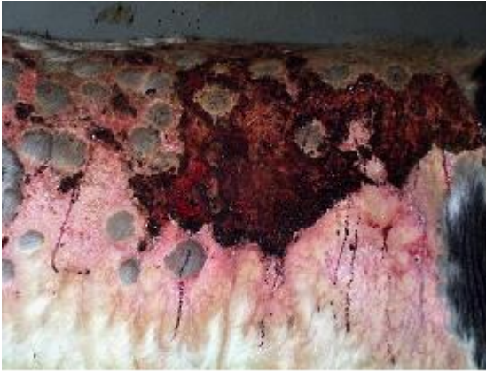
Fig 1: Typical cases of photosensitization affect non-pigmented skin which may ooze serum.

Photosensitisation occurs either as a primary condition following ingestion of photodynamic agents or secondary to liver damage, resulting in retention of the photosensitising agent phyloerythrin.