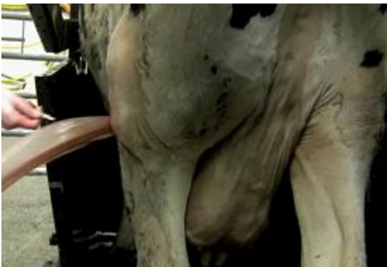
Fig 12: Abscesses are lanced, drained and flushed.