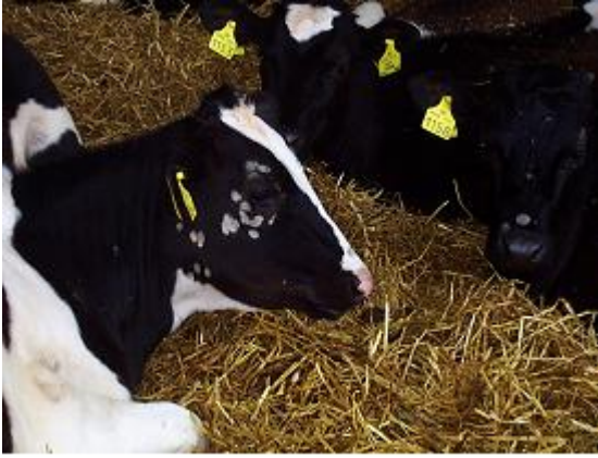
Fig 5: Spread to other animals in the group..

Diagnosis is based upon demonstration of spores on microscopic examination of plucks of hair surrounding the lesions.