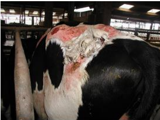
Fig 2: During the later stages the affected skin becomes dry and parchment-like and sloughs off.

Typical cases of photosensitization affect the muzzle and non-pigmented skin. The affected skin may ooze serum. During the later stages, the affected skin becomes dry and parchment-like and sloughs off.