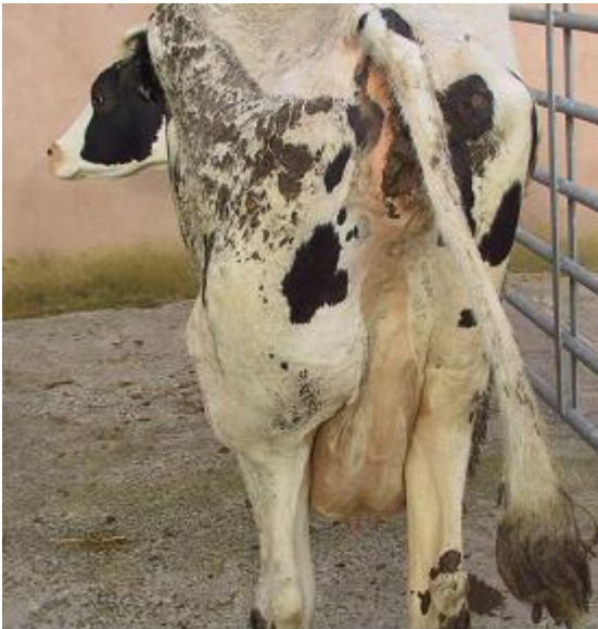
Fig 11: Large superficial swellings can be investigated ultrasonographically by your veterinary surgeon. This swelling was an abscess (see below).

infection. Abscesses are lanced, drained and flushed.