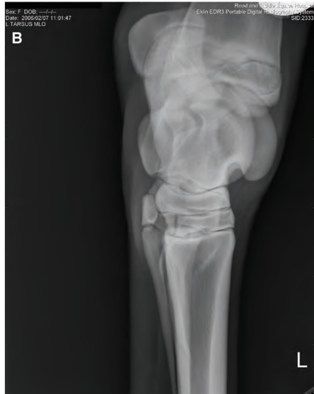
Fig. 11. (A) Positioning for a dorsal 25° medial-plantar lateral view of the tarsus. (B) Dorsal 25° medial-plantar lateral view of the tarsus.