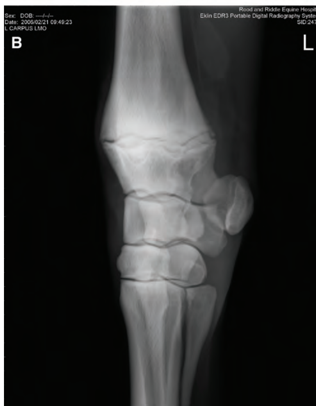
Fig. 6. (A) Positioning for a dorsal 55° lateral-palmar medial oblique view of the carpus. (B) Dorsal 55° lateral-palmar medial oblique view of the carpus.