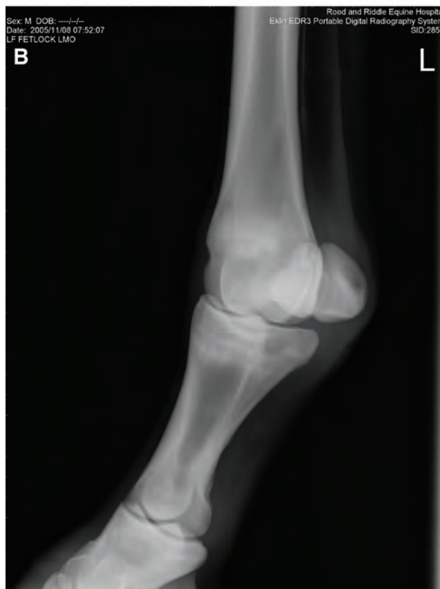
Fig. 2. (A) Positioning for a dorsal 10° proximal 30° lateral-palmar distal medial oblique view of the fetlock. (B) Dorsal 10° proximal 30° lateral-palmar distal medial oblique view of the fetlock.

The radiographer, the cassette holder, the horse handler, and anyone else in the area should wear protective lead aprons. Lead thyroid protectors are recommended, and the cassette holder should wear lead gloves. Radiation monitoring badges are necessary for anyone routinely exposed to radiation, and the exposure levels should be monitored closely. No one less than 18 years of age should be in the vicinity of the radiographic beam. 3