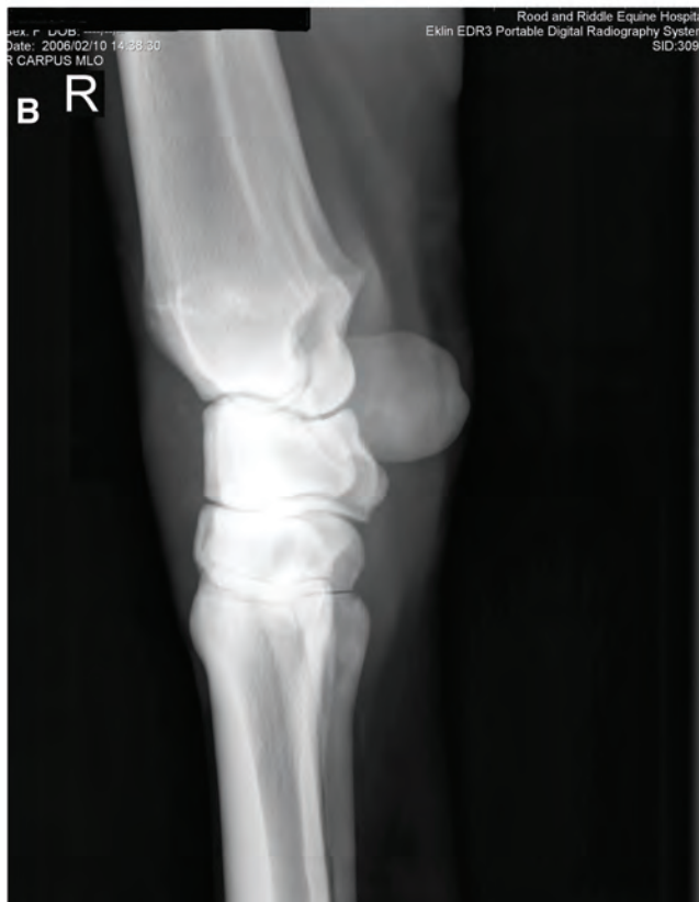
Fig. 7. (A) Positioning for a dorsal 65° medial-palmar lateral oblique view of the carpus. (B) Dorsal 65° medial-palmar lateral oblique view of the carpus.

step, the dorsal aspect of P1 will be obscured, potentially hiding a chip. 4 If the elevation is not steep enough, the palmar/plantar aspect of the joint may be obstructed from view because of overlap from the proximal sesamoid bones. 4 The more distally the sesamoids are positioned relative to the rest of the fetlock, the more elevation is required. The opposite is true for more proxi-