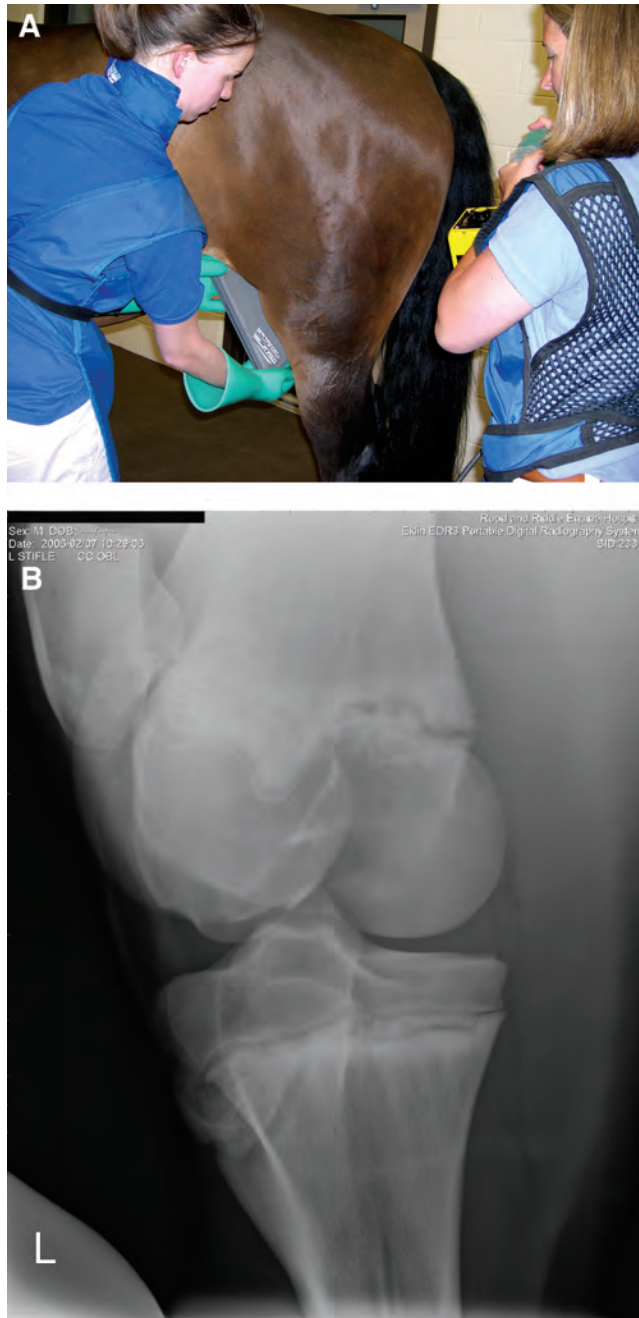
Fig. 14. (A) Positioning for a caudal 10° proximal 20° lateral-cranial distal medial oblique view of the stifle. (B) Caudal 10° proximal 20° lateral-cranial distal medial oblique view of the stifle.

radiograph must allow for visualization of both the medial femoral condyle and the abaxial aspect of the lateral trochlear ridge. 7 To achieve adequate visualization of the abaxial aspect of the lateral trochlear ridge, it may be necessary to be 30–40° lateral to the caudal plane.