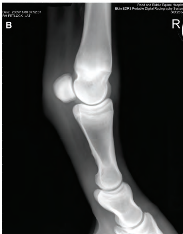
Fig. 5. (A) Positioning for a standing lateral-medial view of the fetlock. (B) Standing lateral-medial view of the fetlock.