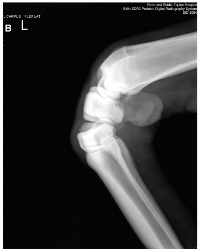
Fig. 8. (A) Positioning for a flexed lateral-medial view of the carpus. (B) Flexed lateral-medial view of the carpus.

mally positioned sesamoids as seen in upright limb conformation.