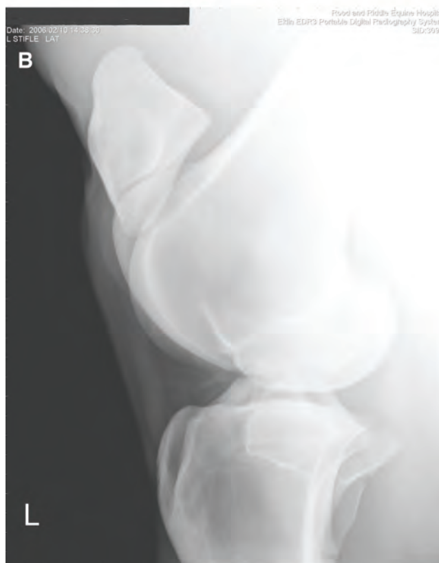
Fig. 13. (A) Positioning for a lateral-medial view of the stifle. (B) Lateral-medial view of the stifle.

This allows evaluation of the distal tarsal joint spaces, the distal intermediate tibial ridge, and the distal trochlear ridges. 6