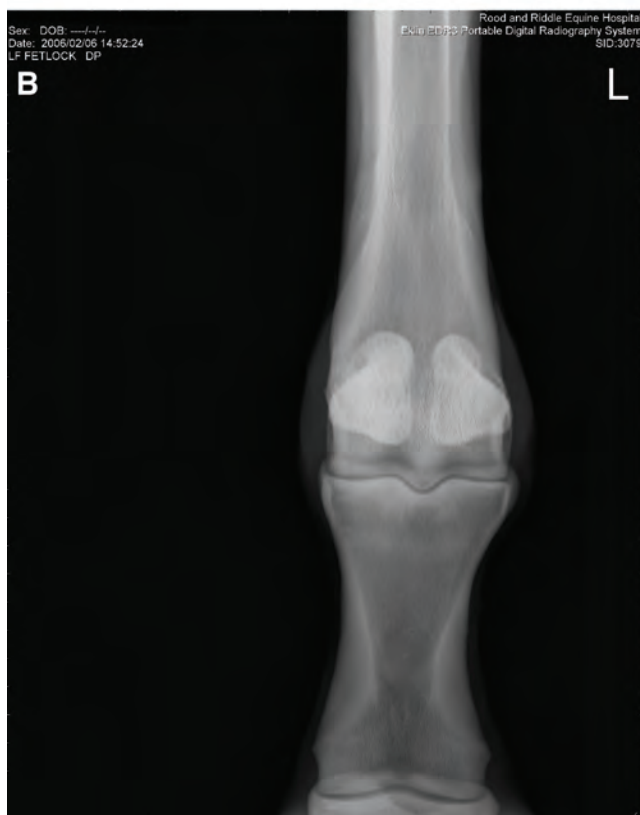
Fig. 1. (A) Positioning for a dorsal 15° proximal-palmar distal view of the fetlock. (B) Dorsal 15° proximal-palmar view of the fetlock.