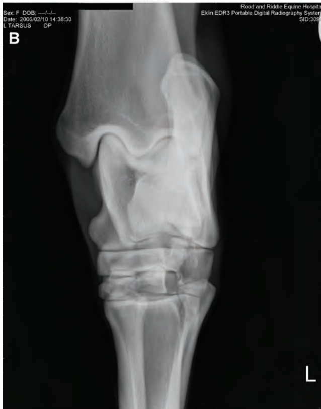
Fig. 10. (A) Positioning for a dorsal 10° lateral-plantar medial view of the tarsus. (B) Dorsal 10° lateral-plantar medial view of the tarsus.