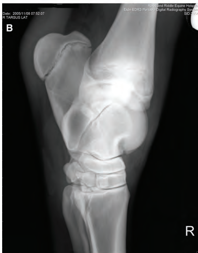
Fig. 12. (A) Positioning for a lateral-medial view of the tarsus. (B) Lateral-medial view of the tarsus.