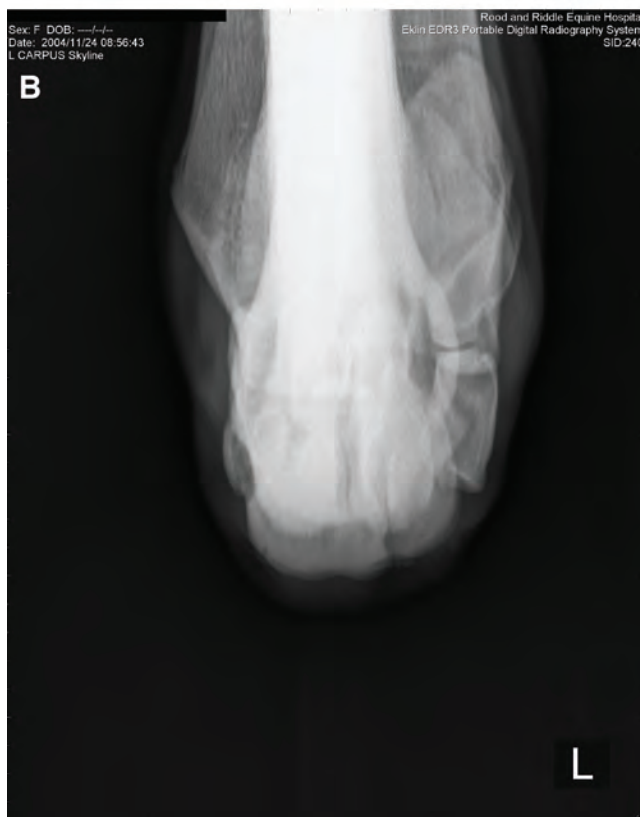
Fig. 9. (A) Positioning for a dorsal 30° proximal-dorsal distal view of the carpus. (B) Dorsal 30° proximal-dorsal distal view of the carpus.

directly lateral to the fetlock. It is important that the proximal and distal sagittal ridge is visible, and the sesamoids are superimposed. 4