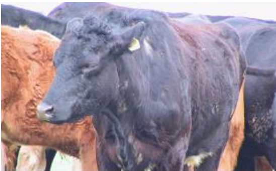
Fig 1: IBK lesions are very painful and disrupt grazing patterns causing poor performance and even weight loss.