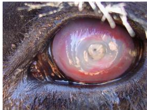
Fig 3: Advanced case of IBK showing deep corneal ulceration

Spontaneous recovery may occur in mild cases three to five days after clinical signs are first observed, and is complete two weeks later. In severe cases, ulceration may progress to corneal perforation but this is uncommon.