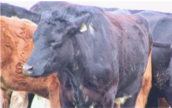
Fig 1: IBK lesions are very painful and disrupt grazing patterns causing poor performance and even weight loss.