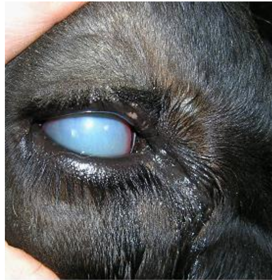
Fig 5: With silage eye there is a bluish-white opacity of the surface of the eye within two to three days.

Bovine iritis, colloquially known as "silage eye" in the UK, is a common cause of uveitis in cattle of all ages fed winter rations of baled silage/haylage.