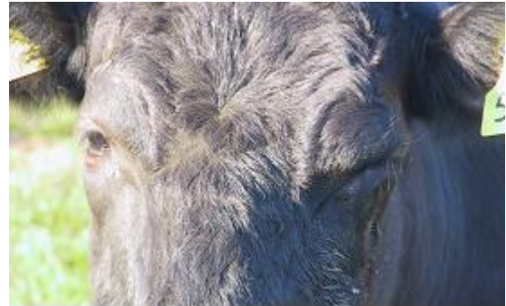
Fig 2: There is marked pain when the eye is exposed to direct sunlight. Note the obvious tear-staining of the face.

Spontaneous recovery may occur in mild cases three to five days after clinical signs are first observed, and is complete two weeks later. In severe cases, ulceration may progress to corneal perforation but this is uncommon.