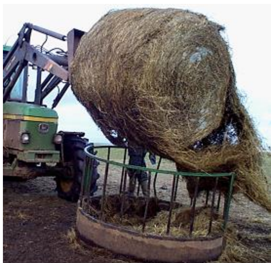
Fig 7: Poor quality silage fed in ring feeders is the major risk factor for silage eye.

Big-bale silage can be rolled out rather than placed in ring feeders to prevent cows burrowing their heads into the bale but this is impractical in most situations. Attention to detail when baling and wrapping silage and ensuring appropriate fermentation conditions should limit contamination with L. monocytogenes the cause of this problem. However, exposure to air for several days before the large bale is eventually eaten provides an ideal environment for L. monocytogenes multiplication.