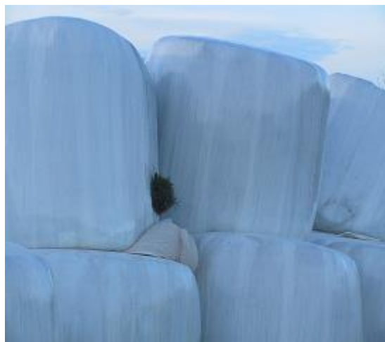
Fig 8: Perforations to the plastic wrap should be repaired immediately.