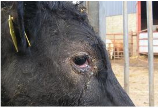
Fig 4: IBD is one of the main differential diagnoses your veterinary practitioner will consider.

Prompt treatment is essential. Topical ophthalmic antibiotic cream containing cloxacillin is commonly used. Antibiotic injection (penicillin, oxytetracycline or ceftiofur) into the dorsal bulbar conjunctiva is the best treatment but can be difficult to achieve in fractious cattle and requires good restraint. Injection into the upper palpebral conjunctiva is commonly used but it should be noted that this technique will not give residual antibiotic levels in the eye and relies on leakage onto the cornea from the injection site. This technique has no advantage over systemic injection except the much lower cost because of the smaller antibiotic dose.