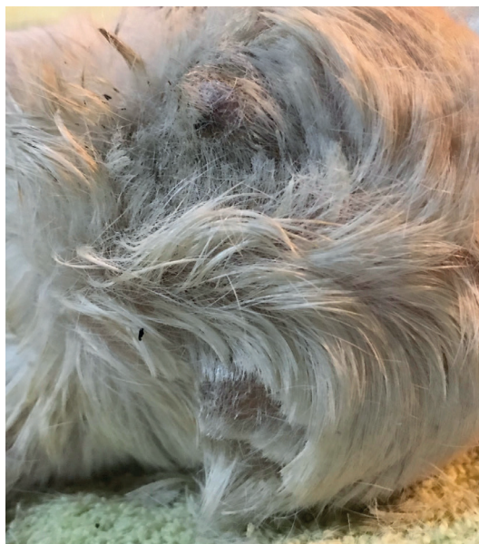
Fig 6: Horn buds exposed by clipping with scissors