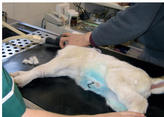
Fig 2: Anaesthesia by mask for disbudding in the surgery