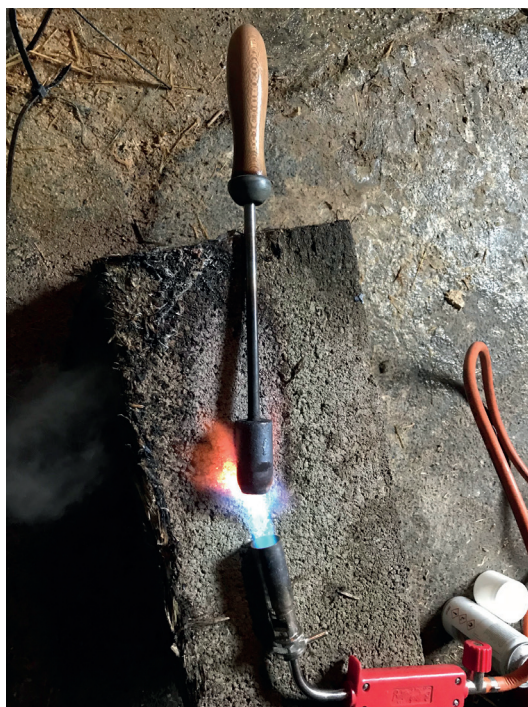
Fig 4: Disbudding iron being heated by a blowtorch