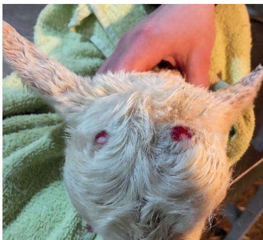
Fig 7: Horn bud tips have been removed to allow direct contact of the iron with the skull

fracture. Avoid prolonged application of the hot iron to the skull. It is better to apply the iron for two to three seconds at a time, followed by two to three seconds off the skull, repeating as necessary until the horn bud can be removed.