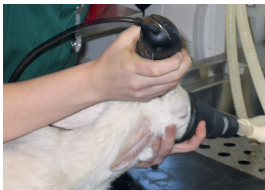
Fig 5: Clipping hair with electric clippers

Calf disbudding irons are adequate for disbudding small kids provided they reach a satisfactory temperature and have a large enough diameter head (minimum 2 cm, preferably 2.5 cm or 2.8 cm for male kids). Gas irons are probably better than electric irons, but the latter can be used effectively and are safer if gaseous anaesthesia is being used. Dehorning irons heated in a gas blowtorch to 600°C are also suitable. The GVS can provide modified calf disbudding copper irons that have been specifically remodelled for the disbudding of goat kids. These irons require a separate heat source/gas cylinder (Fig 4).