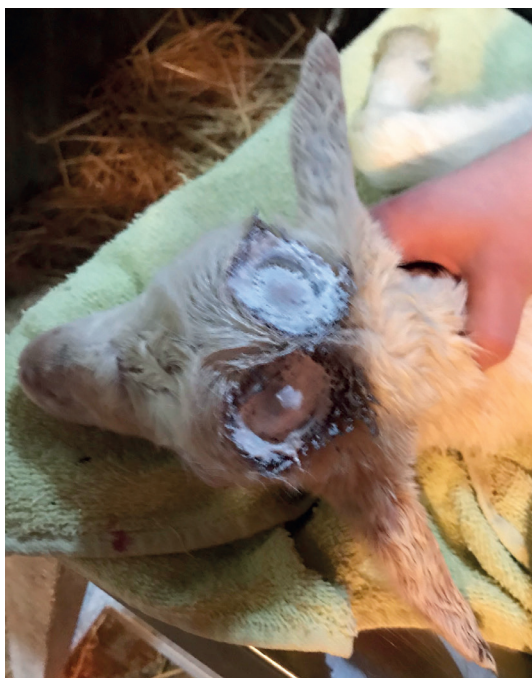
Fig 9: Kid that has had topical spray applied to the cauterised area immediately after disbudding

veterinary surgeons to forget that they are dealing with a neonatal animal. As with all surgical procedures, basic preparation and planning beforehand (how is the kid to be handled before, during and after surgery) will reduce risk to the animal. Familiarisation with the disbudding technique, administration of short-acting anaesthetic agents and the use of suitable equipment will all help to ensure a successful outcome. Wherever possible, growing kids should be examined a month or so after disbudding to determine whether the whole horn bud has been removed or if there is regrowth of horn and scur formation.