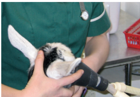
Fig 1: Anaesthetic induction by mask