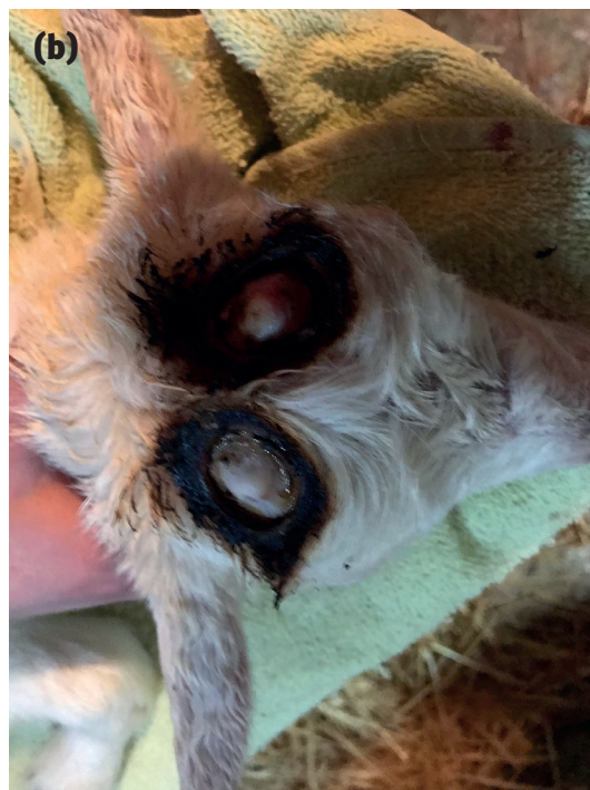
Fig 8: Kid with (a) the left-hand side horn bud removed and (b) both horn buds removed