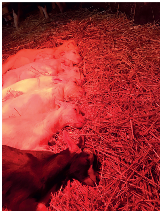
Fig 3: Anaesthetised kids awaiting disbudding on farm

of veterinary surgeons disbudding around 2000 kids per year between them and routinely using analgesics, no adverse reactions were reported.