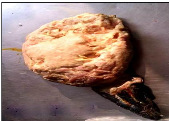
Figure 3: Sloughed off Necrosed teat