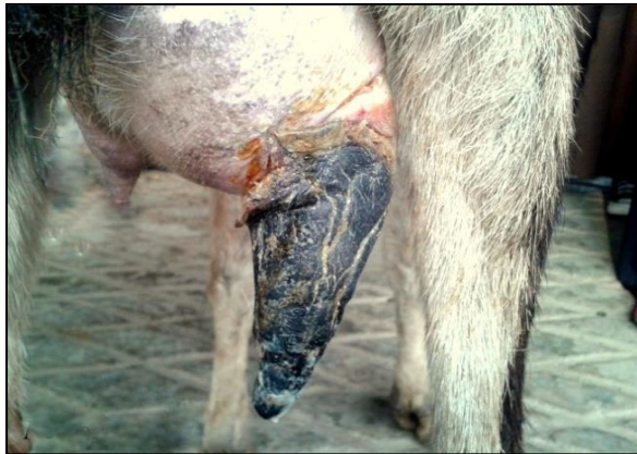
Figure 1: Right Necrosed teat