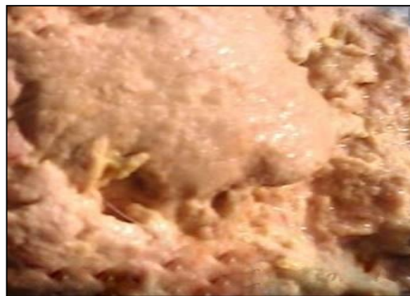
Figure 4: purulent pus discharge escaping from wound of Necrosed teat

discharge containing pus. No treatment was done by the owner except massage of respective teat and udder with lukewarm salt water for sake of reduces swelling but all in vain and left a dark gangrenous dried mass. Case presented on 20 th day of kidding. Clinically high fever (104.2), increase in heart beat (110 beats/min) was noted. Affected teat sloughed off during physical manipulation escaping a purulent exudate from acini and inter-lobular spaces (Figure 3-4) of udder also reported by Yeshwantkumar and Nirmala (2008). Left teat was normal apparently but a little swelling just above on udder was seen (Figure 2). Surf field mastitis test was performed for milk sample from left teat and found to be 2 positive (++) for mastitis with 1 \times 10^6 Somatic cell count (SCC).