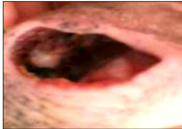
Figure 7 and 8: Wound clear from purulent pus after 12 days of treatment

In present study, a typical case of gangrenous mastitis is reported which is caused by S. aureus . Similar result reported by Margona et al. , (2012); White and Hinckley, (1999). Infection usually occurs after kidding with development of enlarge pendulous udder. Milk in udder provide site for bacterial multiplication and if remain untreated, may develop into chronic mastitis (Alawa et al. , 2000).