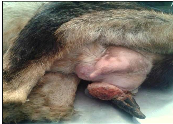
Figure 2: Swelling just above the left teat