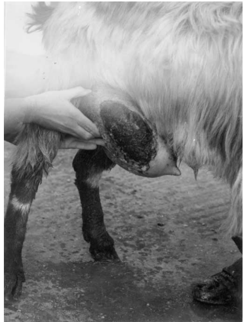
Fig. 1. Unilateral gangrenous mastitis in a goat.

chronic obstructive mastitis, and irreparable udder injuries (Oehme, 1988). Often, the affected udder is enlarged and highly vascularized making mastectomy (Youssef, 1999). Classical amputation of the bovine udder is a radical, high-risk procedure. A better alternative is the use of ligation of the external pudendal artery (Brewer, 1963; Horney, 1985). Amputation of the affected teat has also been described in association with vascular ligation for mastectomy in cattle (Noordsy, 1989). Ligation of bovine udder vasculature with subsequent sloughing of the affected quarters has generally supplanted surgical amputation (Noordsy, 1989). Nevertheless, ligation of the external pudic artery was not recommended as an alternative technique for surgical mastectomy in goats (Makady et al., 1990). The aim of this work is to study vascular ligation and teat amputation as an alternative technique for mastectomy in goats and to compare this technique with the routine, classical, total or partial mastectomy.