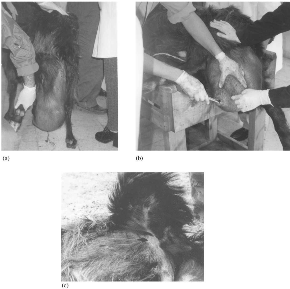
Fig. 4. (a) Bilateral gangrenous mastitis with wide diffuse abdominal attachment in a goat; (b) the same animal after amputation of the teat; (c) 3 weeks after teat amputation and vascular ligation, notice complete atrophy of the mammary gland, arrow.

technique was applied unilaterally in four goats and bilaterally in three goats. A linear oblique skin incision 5 cm length was performed at the level of the external inguinal ring (Fig. 3a). The landmark for this incision was 6–8 cm dorsolateral to the base of the mammary gland and at the level of its caudal–lateral border. Blunt dissection was performed and the external pudendal artery and vein were isolated, double ligated with No. 0 chromic catgut and severed in-between (Fig. 3b). Skin incision was closed using silk (No. 1) in a simple interrupted pattern. The superficial caudal epigastric vein (milk vein) was ligated perc-