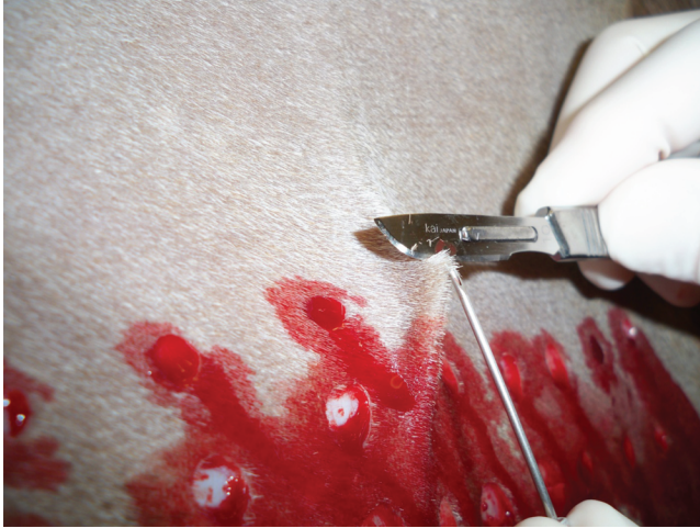
Fig. 3. Harvest of a pinch graft. The skin has been tented with a hypodermic needle and a scalpel blade is used to excise the graft.

full thickness in thin-skinned horses). Smaller-diameter grafts can be harvested but are more challenging to handle. Multiple grafts are harvested at once, leaving a 1 × 1-cm interval between harvest sites. Grafts are held in saline-moistened gauze sponges until implanted. Donor site wounds are usually partial thickness and do not require closure. Donor sites heal quickly, with little evidence of scarring (Figs. 4 and 5). If donor site wounds are full thickness, a single suture or staple can be placed if desired.