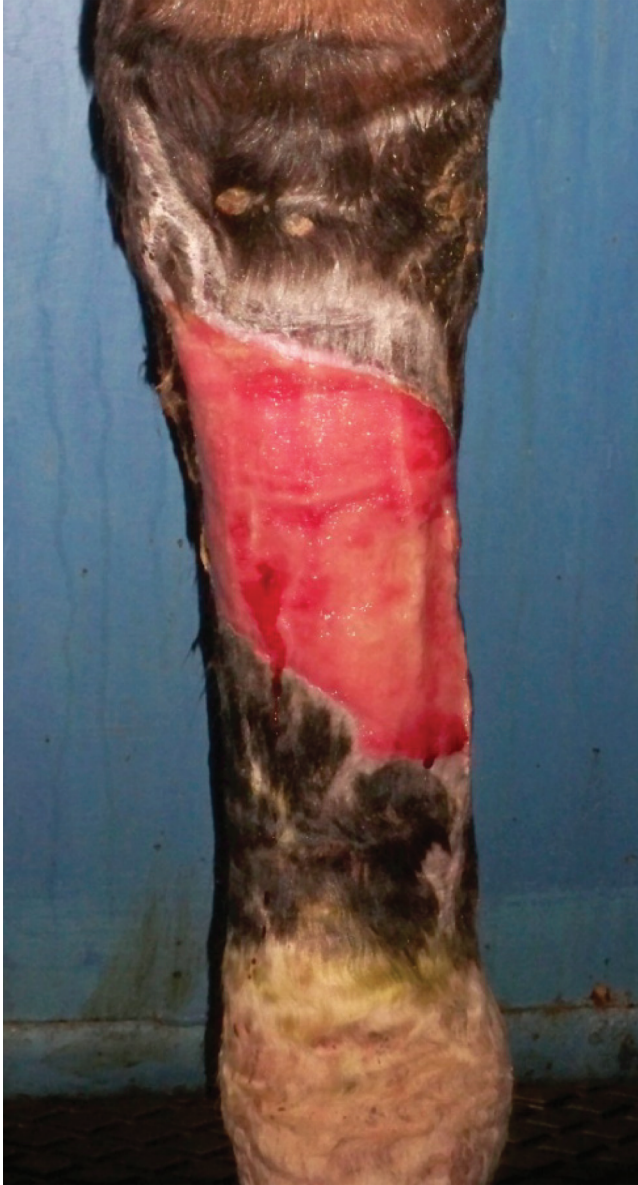
Fig. 1. Wound on the metatarsus that is an excellent candidate for pinch grafting as the bed is flat and highly vascular, with no evidence of infection.

pinch grafting performed 4 to 5 days later, when new highly vascular granulation tissue has filled the defect.