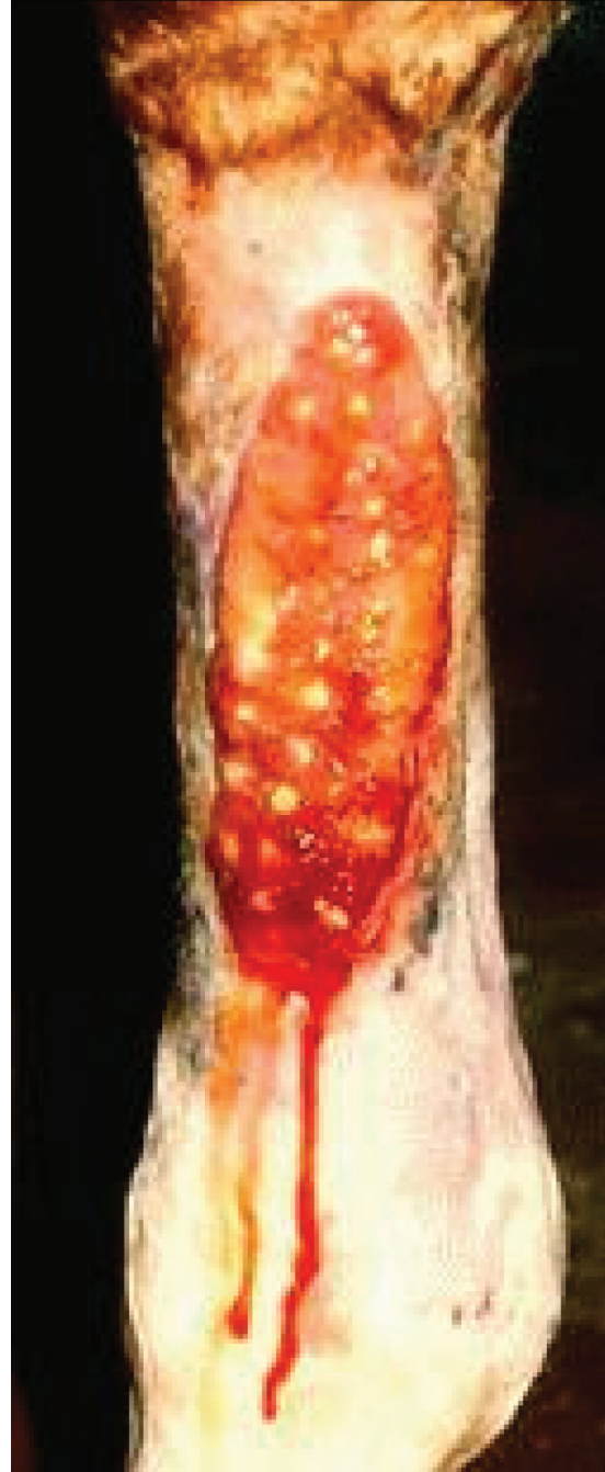
Fig. 9. Epithelial islands are evident in this metatarsal wound (approximately 3 weeks after grafting).

These grafts are small and predominantly split thickness, so few hair follicles are transplanted; even fewer survive the severe hypoxia immediately after grafting. Despite these disadvantages, pinch grafting has clear value in wound management.