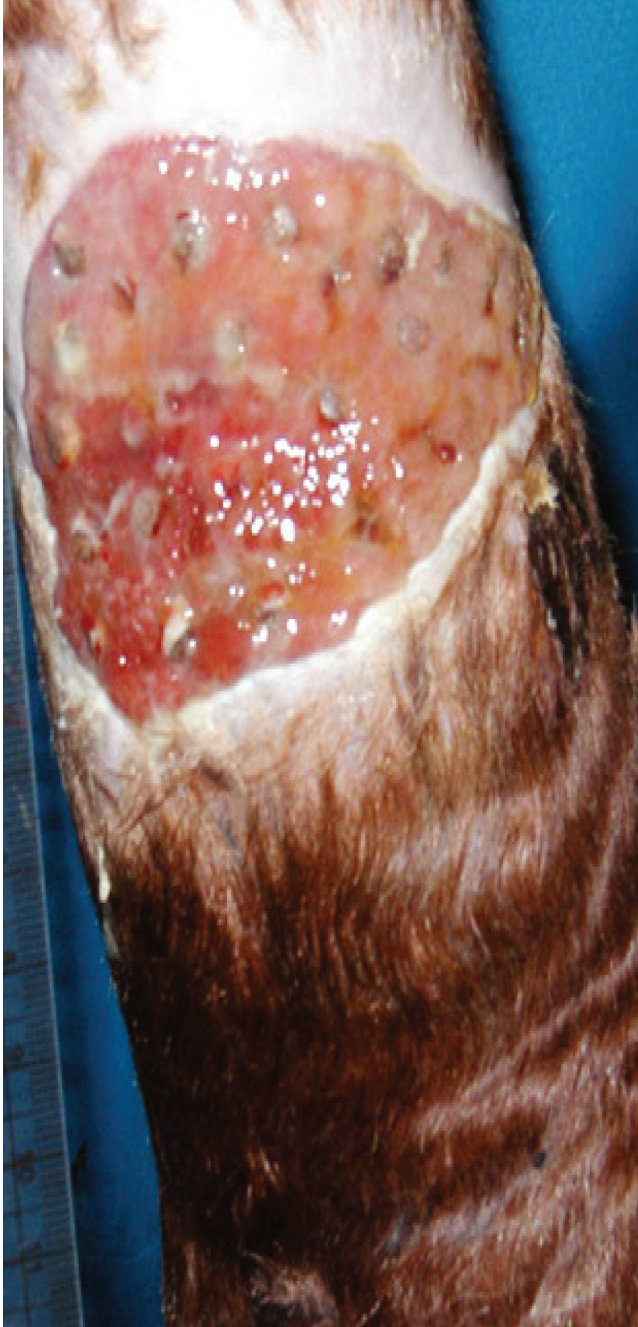
Fig. 8. Metatarsal wound approximately 10 days after pinch grafting. Overlying granulation tissue has lysed and pale grafts are evident.