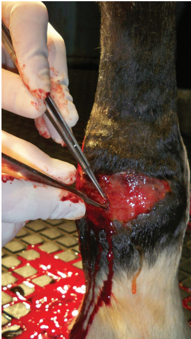
Fig. 6. Graft placement. A pocket with a dorsal opening has been made with the No. 15 blade, and splinter forceps are being used to insert the graft.