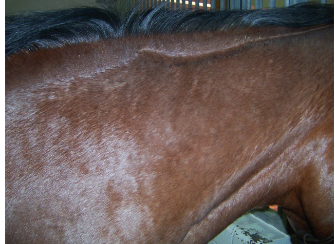
Fig. 5. Same site as Fig. 4, 4 months later. No scarring is visible, but small fibrotic areas are evident on palpation.

working dorsally, pinch grafts are placed on a 1 × 1-cm grid. A No. 15 scalpel blade d is stabbed into the granulation bed in a ventral direction to make a 1-cm-deep pocket just below the surface of the granulation tissue. A pinch graft, with the epidermal surface most superficial, is inserted into the pocket, using splinter forceps e (Fig. 6). Hair growth after pinch grafting is sparse and erratic, so it is not necessary to orient grafts by the direction of hair growth. An alternative technique is to use a curved mosquito hemostat to insert grafts in the granulation tissue without first making pockets.