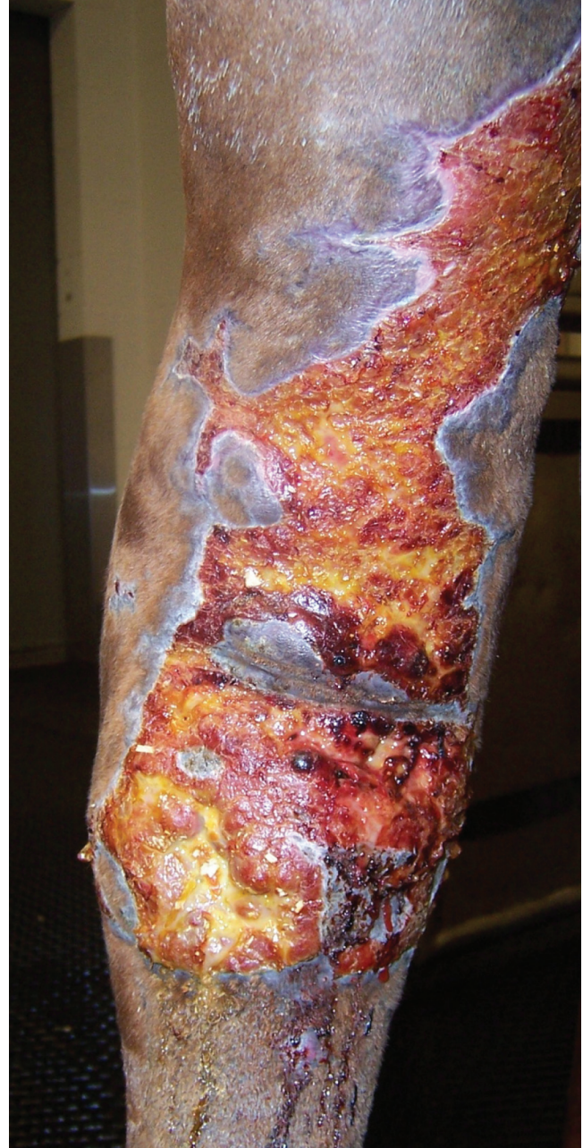
Fig. 2. Wound on the dorsum of the tarsus that is chronic and fibrotic and therefore a poor candidate for grafting unless granulation tissue is superficially excised and new tissue is allowed to fill the wound.

Horses are normally started on potassium penicillin a (20,000 IU/kg IV qid), gentamicin b (6.6 mg/kg IV q 24 h), and phenylbutazone c (2 to 4 mg/kg IV or PO bid) before surgery and maintained for 5 to 7 days. Normally, pinch grafting is done with the horse standing and under appropriate sedation. The lateral cervical area under the mane is a convenient donor site and is used most commonly, but other cosmetically inconspicuous sites includ-