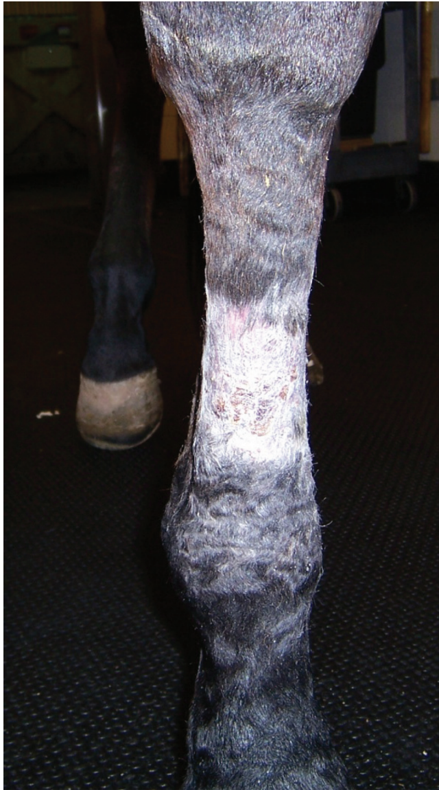
Fig. 10. Metacarpal wound 6 weeks after pinch grafting.

If successful, they are effective in promoting epithelialization and, as full-thickness grafts, have at least the potential to provide better hair coverage. Unfortunately, the ultimate cosmetic outcome is often not markedly different from that achieved with pinch grafting. 1 Full-thickness skin grafts have recently been described for clinical use in horses. 6 Skin can be harvested from the pectoral area in a standing horse and, after meticulous removal of the subcutaneous tissues, applied to the wound. If successful, this technique leads to excellent cosmetic results and durability, but coverage of larger wounds is limited by availability of donor skin.