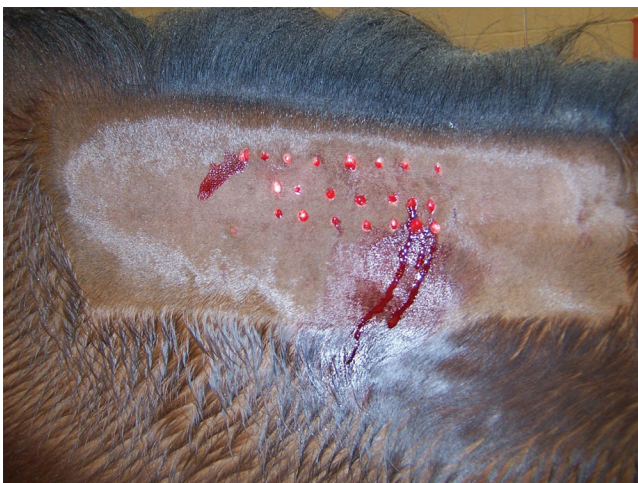
Fig. 4. Lateral cervical area used as donor site for pinch grafting immediately after surgery. No sutures were placed.

Local anesthesia of the wound bed is not necessary because granulation tissue is not innervated. Starting at the dependent part of the wound and