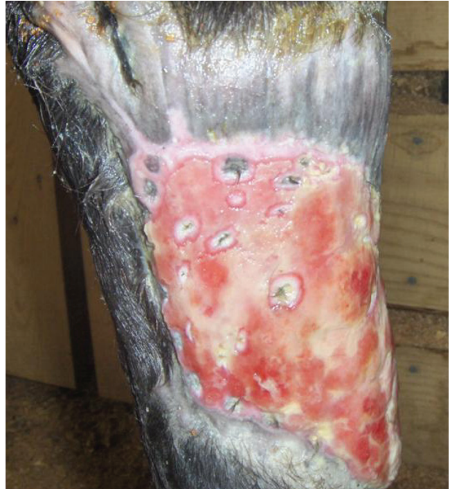
Fig. 11. Proximal metatarsal wound 8 weeks after grafting. A few epithelial islands are evident, but little overall epithelialization has occurred. The pale and fibrotic granulation tissue should be excised and allowed to fill with fresh tissue before a second grafting attempt.

If successful, they are effective in promoting epithelialization and, as full-thickness grafts, have at least the potential to provide better hair coverage. Unfortunately, the ultimate cosmetic outcome is often not markedly different from that achieved with pinch grafting. 1 Full-thickness skin grafts have recently been described for clinical use in horses. 6 Skin can be harvested from the pectoral area in a standing horse and, after meticulous removal of the subcutaneous tissues, applied to the wound. If successful, this technique leads to excellent cosmetic results and durability, but coverage of larger wounds is limited by availability of donor skin.