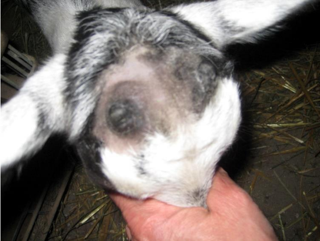
Proper size of horn buds