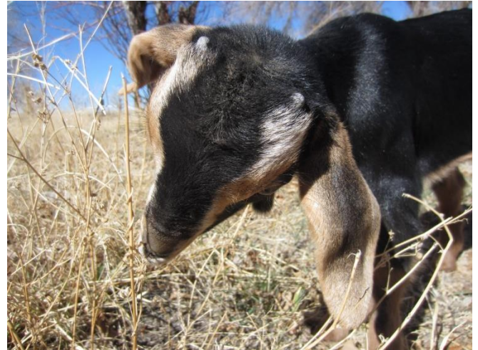
Horn buds that are too large