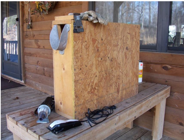
Kidding box and supplies.

The equipment that you will need to disbud is a disbudding iron (available at feed stores or online livestock supply stores), a board to test the iron, and clippers to remove the hair around the horn buds. A kidding box is also extremely helpful, especially if you are limited on extra hands around the farm. There are many plans available online that can be made specific to your breed of goat.